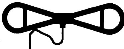
Figure 3, Antenna Modification