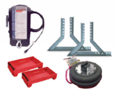
Vehicle Loading Package 9020030 (Includes: winch, wheel stands, car dollies, and 2 bag air jack)