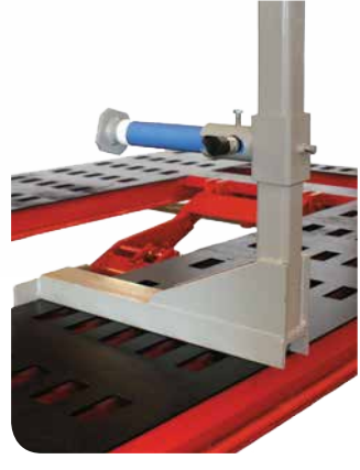
Pushing Post with Ram and Pump 9025018