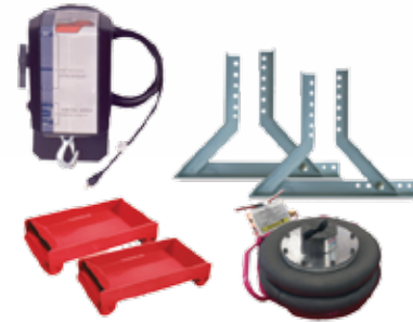
Vehicle Loading Package 9020030 (Includes: winch, wheel stands, car dollies, and 2 bag air jack)