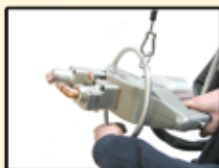
Wide range of positions