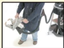
Clamp and cable support