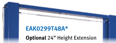
EAK0299T48A* Optional 24" Height Extension