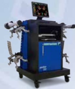
Portable Imaging Alignment Systems