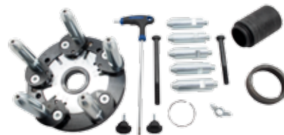
Reverse Mount Wheel Adapter Kit (EAA0364G00A)

For more information regarding the monty™ 8100S, call 800.251.4500 (US) or 501.505.2662 (Canada) www.hofmann-usa.com / www.hofmann.ca