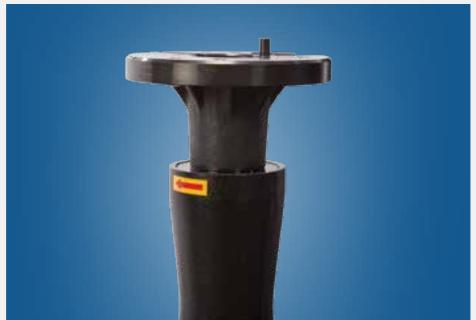
Center Post Clamp Design