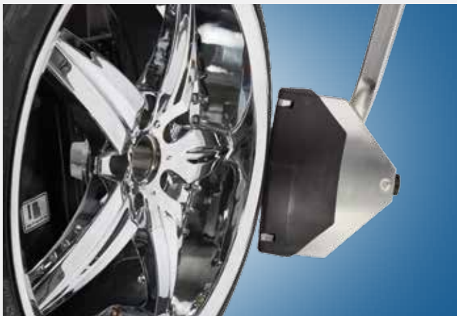
Hand Activated Bead Breaker