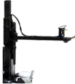
Pneumatic Bead Assist (EAK0317G91A)