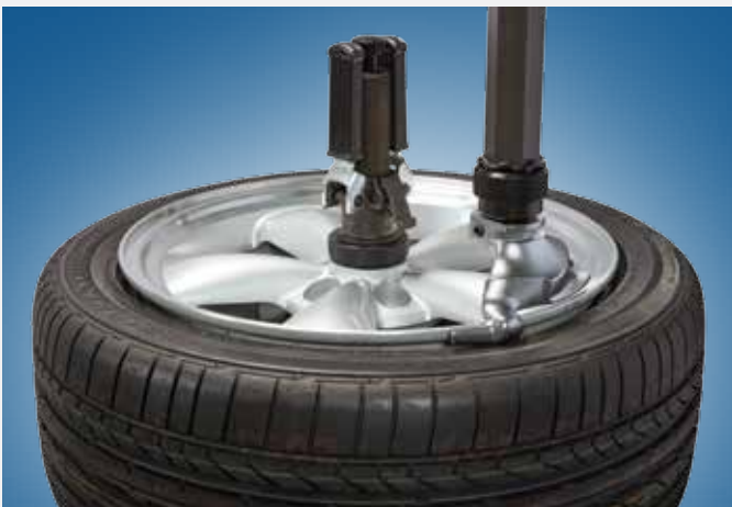
Swing Arm Style Mount/Demount