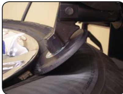
Polymer disc won't damage wheels or tire sensors.