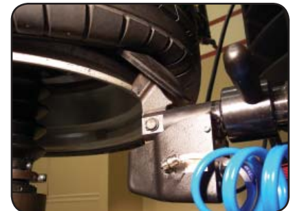
Locking disc position is quick and accurate on both sides of tire.