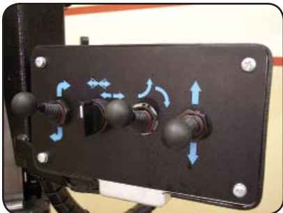
Operator control panel.