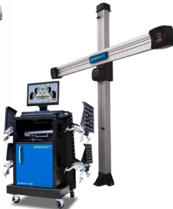
Hofmann geoliner 650 EEWA712AL