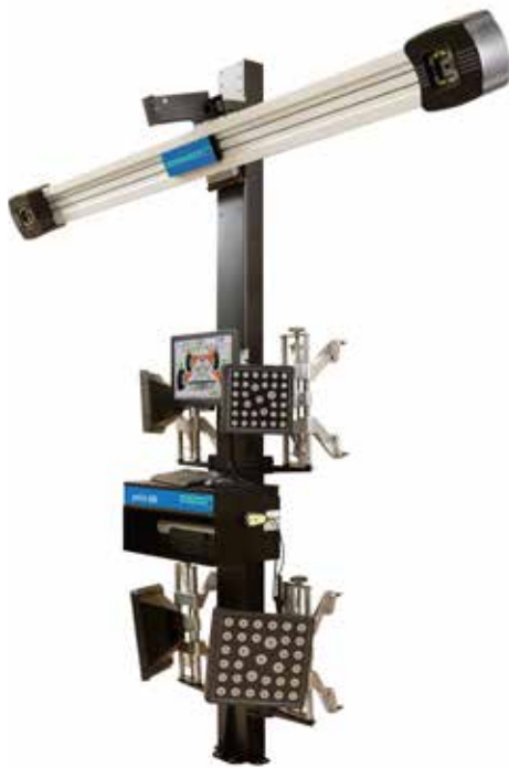
Hofmann geoliner 600 EEWA721AL