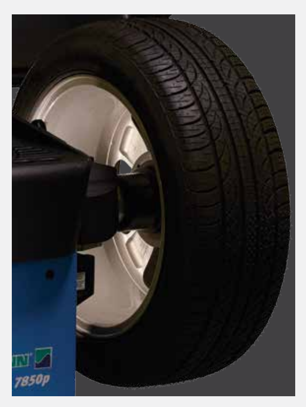
Rim Lighting High-brightness LED lighting system allows for more accurate acquisition of rim dimensions, facilitates rim cleaning and speeds up both data entry and weight positioning.

Pinpoint red laser provides fast, accurate, easy positioning of adhesive weights on the wheel, identifying exact weight placement locations for increased accuracy and productivity.