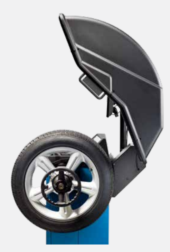
Space-Saving Wheel Guard Flat back panel allows for placement directly against a wall, reducing footprint to save space in the shop.