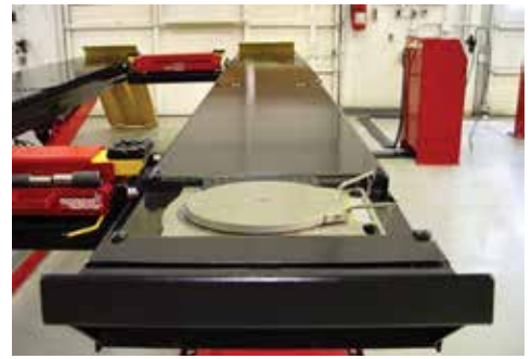
Wide 26" Runways