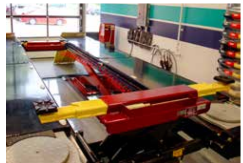
Integrated Air Kit