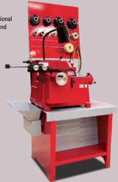
JBC401BL Shown with optional Work Bench and Tool Board