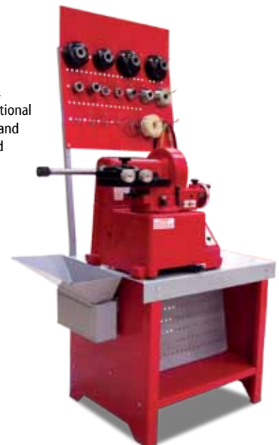
JBC201BL Shown with optional Work Bench and Tool Board