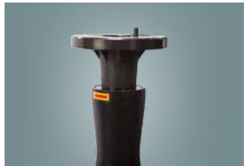
Center Clamp Design