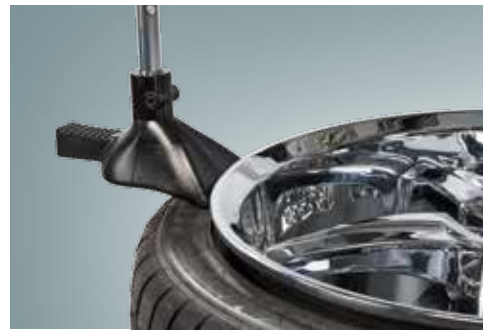
Bead Pusher/Tire Lifting Tool