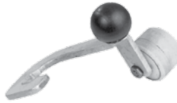
Roller Mounting Help Tool (EAA0304G48A)