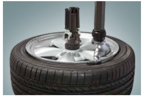
Swing Arm Style Mount/Demount