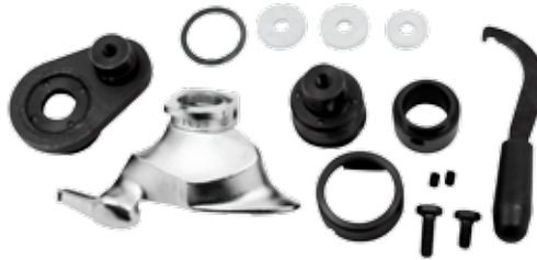
+4 Quick Exchange Device (EAA0304G48A)