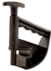
Bead Holding Clamp (EAA0247G70A)