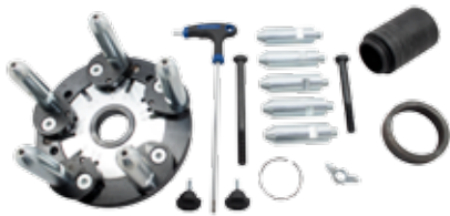
Reverse Mount Wheel Adapter Kit (EAA0364G00A)