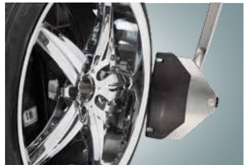
Traditional Bead Breaker