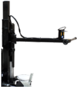
Pneumatic Bead Assist (EAK0317G91A)