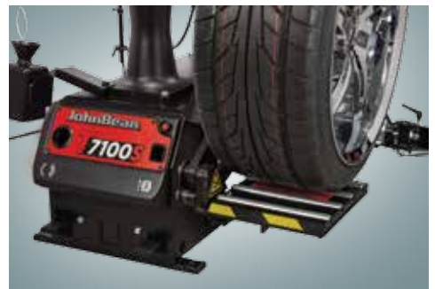
Integrated Wheel Lift