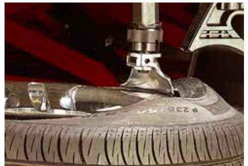
Tire Lifting Tool