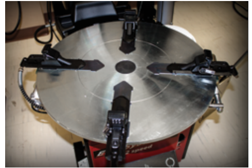
Adjustable Four-Jaw Clamp