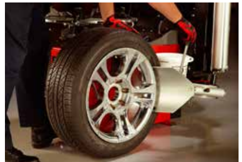
Integrated Bead Breaker