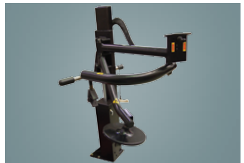
Pneumatic Bead Assist