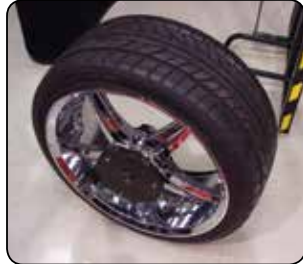
Reverse-Mount/Clad Wheel Adapter