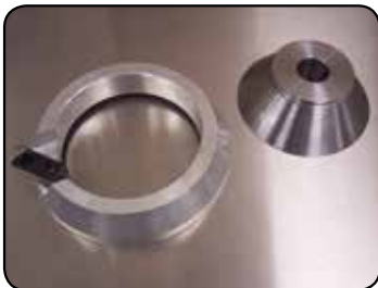
Light-Truck Wheel Kit