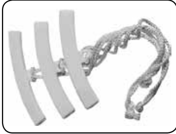
Rim Protector (Snaps onto rim of wheel)