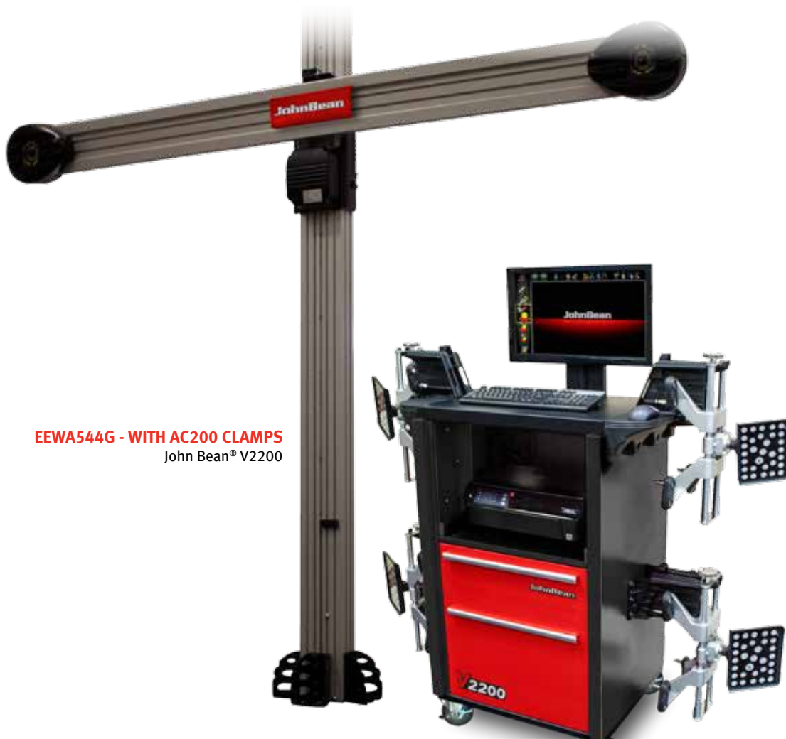
EEWA544G - WITH AC200 CLAMPS John Bean® V2200