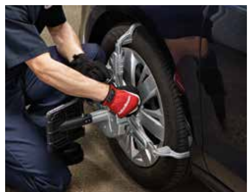
AC400 wheel clamps securely attach to tires without touching the rim; clutch-limited clamping force ensures secure and consistent attachment.