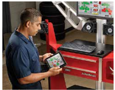
Wireless communication provides control of the unit from anywhere in the shop.

Critical error leading to a bad alignment is detected; user notified that corrective action is required