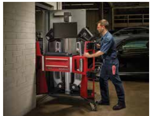
Folding beams, small footprint and casters let your team move the V3300 around the shop as required.