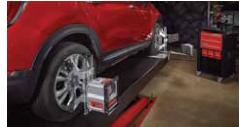
Small footprint makes the most of any available space, bringing advanced, intuitive alignment services to shops of every size.