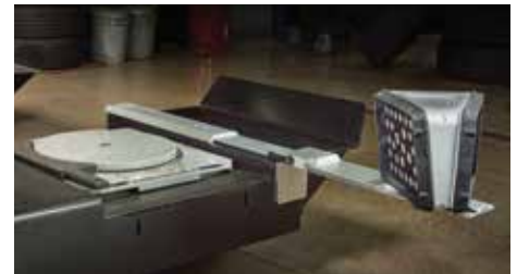
Mounting hardware* adapts to common alignment lifts and is easily removed with quick release system.