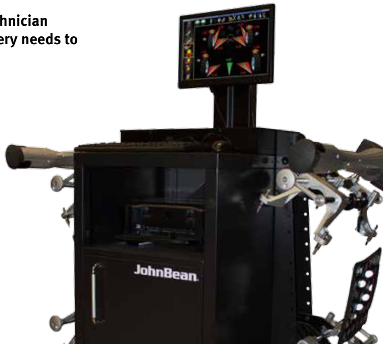
EEWA557B John Bean Prism

Enhance customer satisfaction with personalized reports showing readings before and after service