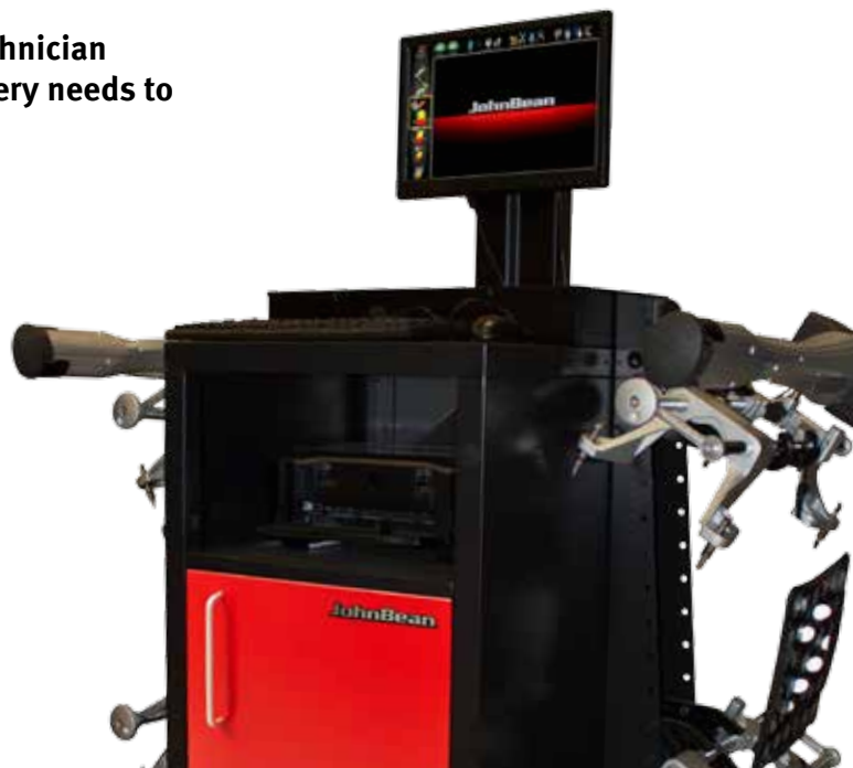
EEWA557B John Bean Prism

Enhance customer satisfaction with personalized reports showing readings before and after service