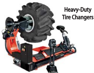
Heavy-Duty Tire Changers