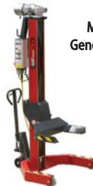
Mobile Column General-Purpose Lifts