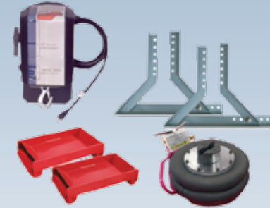
Vehicle Loading Package 9020030 (Includes: winch, wheel stands, car dollies, and 2 bag air jack)