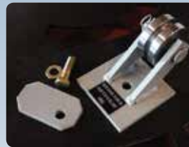
Down Pull 9025008