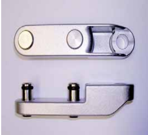
Clamp Extension Kit Kit P/N: EAK0268J62A Extensions per kit: 16 Kits per aligner: 1

With wheels reaching 28" (711mm) and possibly getting even larger, there is a need to easily and quickly address these market changes. The optional clamp extension kit does just that. The maximum wheel diameter of the clamp is increased to 29" (737mm) with this simple kit. The kit includes enough extensions for a complete aligner.