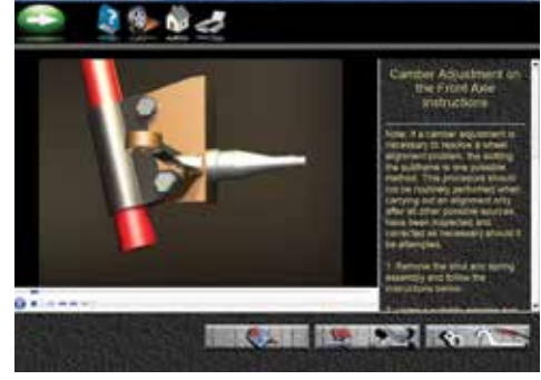
Easy to follow Help Videos