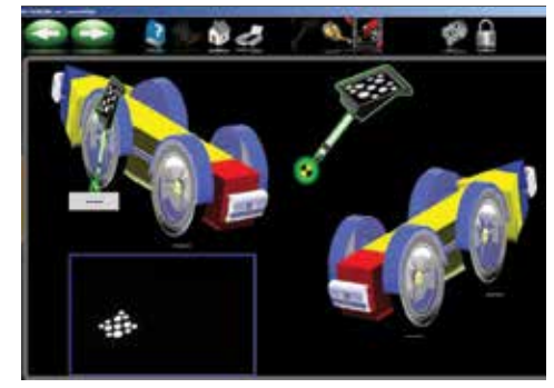
Ride Height Measurement