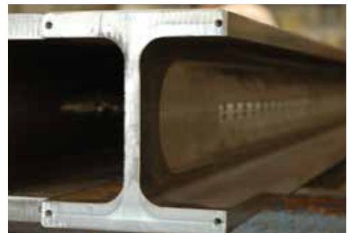
Column Construction, One Piece Beam with Machine Safety Lock Location