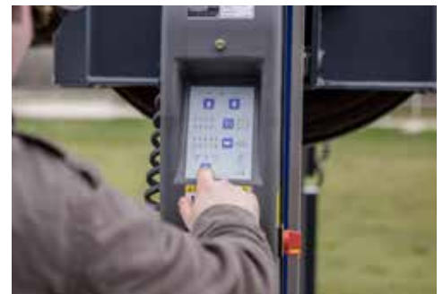
Wireless MCL Control Panel