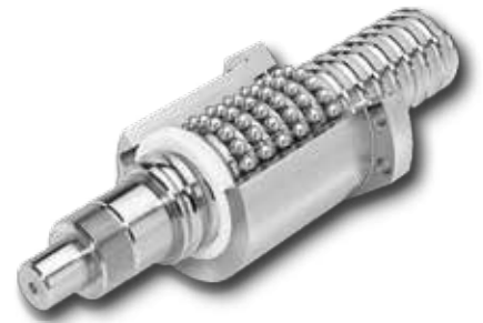
Re-Circulating Ball Screw