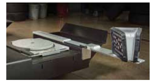
Mounting hardware* adapts to common alignment lifts and is easily removed with quick release system.