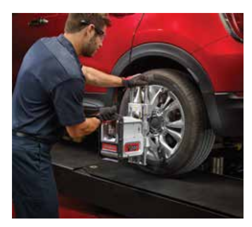
Pods mount with ease, communicating wirelessly and store quickly and easily when finished.