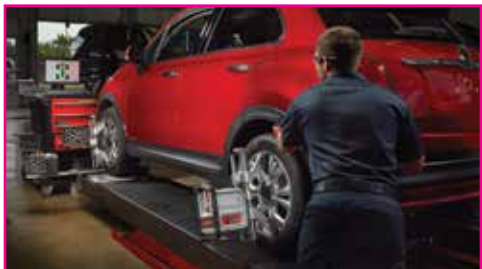
Three levels of intervention—Compensate, Warn, Alert—with corrective actions clearly identified and more information just one click away.