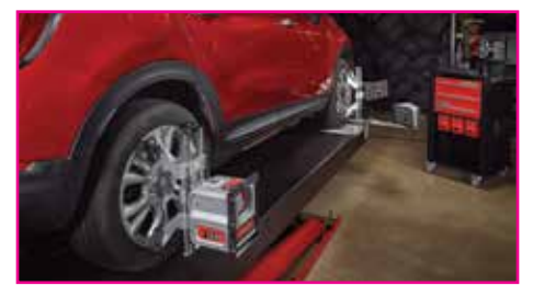
Small footprint makes the most of any available space, bringing advanced, intuitive alignment services to shops of every size.