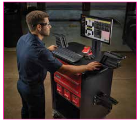
Attractive toolbox styling, featuring easy-rolling casters, storage for all attachments and a fully enclosed printer compartment.