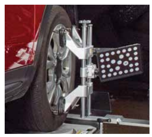
Cast aluminum AC700 wheel clamps fit rims from 11" to 24", with no limitations and 10.9 to 11.5 lbs. (4.9 to 5.2 kg) per clamp.