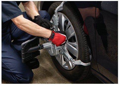
Touchless AC400 Wheel Clamp