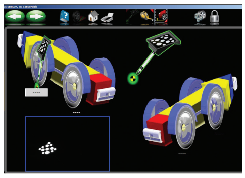
Ride Height Measurement