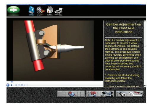
* Patented and/or Patent Pending Features