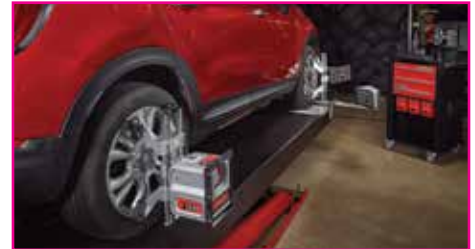
Small footprint makes the most of any available space, bringing advanced, intuitive alignment services to shops of every size.