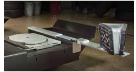
Mounting hardware* adapts to common alignment lifts and is easily removed with quick release system.