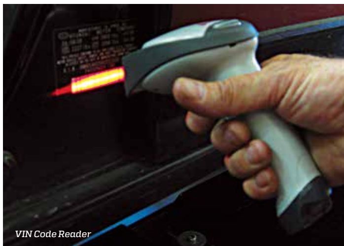
VIN Code Reader