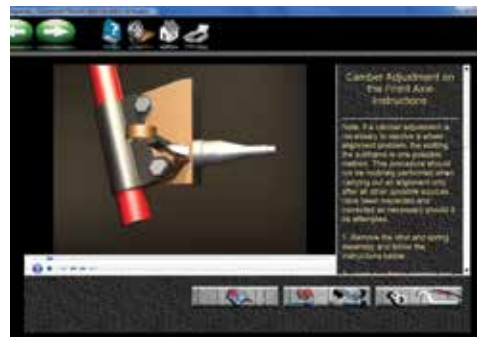
Easy to follow Help Videos