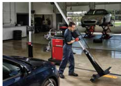
Portable XD Camera Alignment Towers