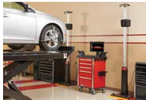
Automatic Vehicle Height Tracking