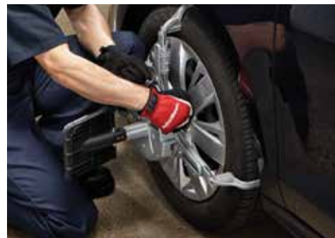
Touchless AC400 Wheel Clamp